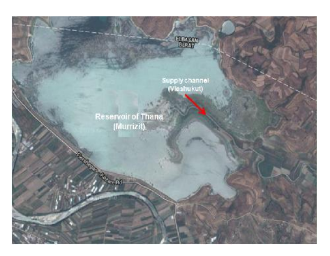
Figure 1. Catchment basin of the Thana reservoir