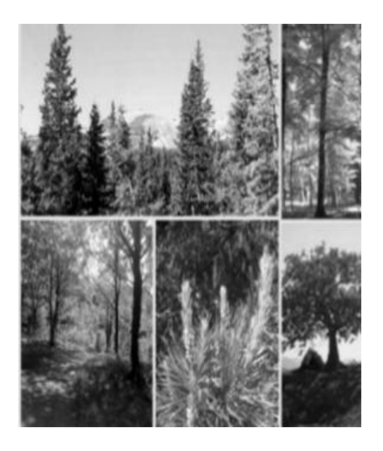
Figure 2 Images for tipical flora of Dajt Park

In addition to plant flora worth mentioning the area is rich in animal flora. So we can mention amphibians, reptiles, birds like the mountain eagle and falcons as well as mammals carnivores like bear and gray wolf, which are often found in this area.