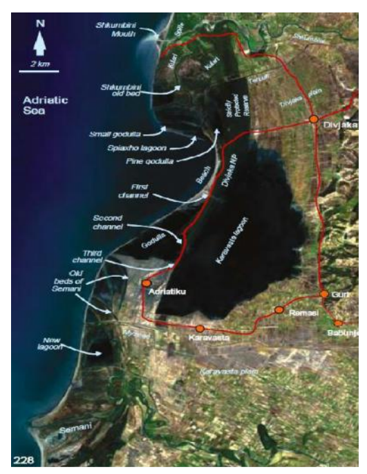
Figure 1. Divjaka area, Albania

Weather data of the years 2008 to 2012 are shown in Table 1 and Figure 2. Mean annual precipitation was 992 mm, mean air temperature was 16.2^{\circ} C.